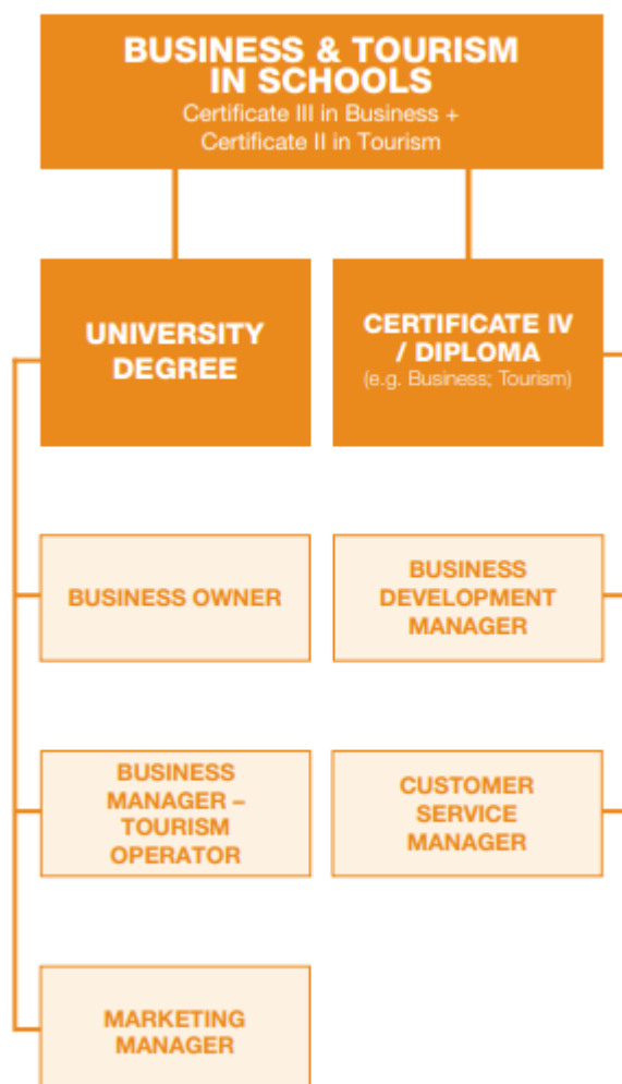
Figure 1. Training and Employment Pathways from BSB30120 Certificate III in Business & SIT20122 Certificate II in Tourism

Graduates of BSB30120 Certificate III in Business may explore further VET pathways (e.g. BSB40120 Certificate IV in Business) at another training provider. Binnacle Training will provide training pathway opportunities for consideration as students are approaching course completion. See Figure 1 below.